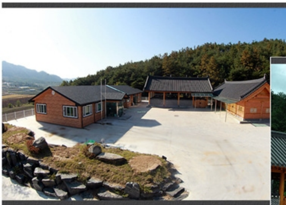
View of Korea Salt Manufacturing Plant