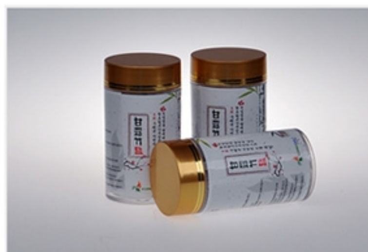
9 times Roasted Bamboo salt powder type 60g (Rough, Fine powder)