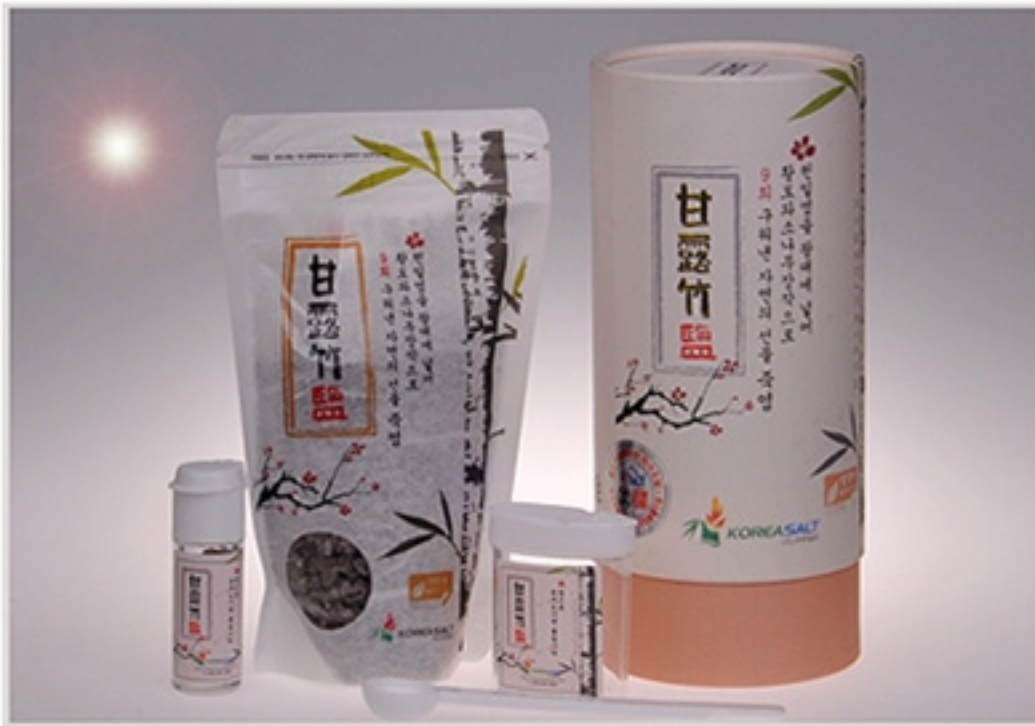
9 times Roasted Bamboo salt grain type 250g (granular, middle, large Size)