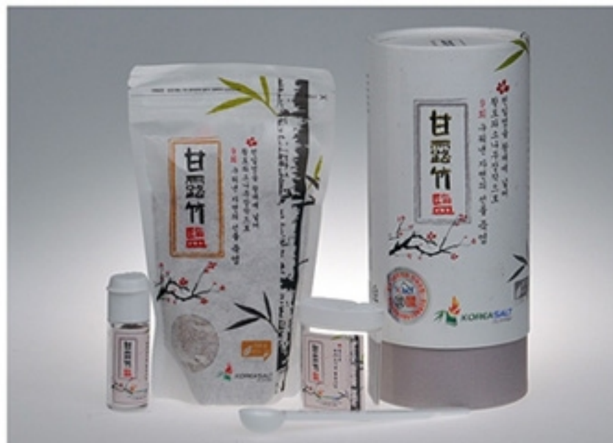
9 times Roasted Bamboo salt powder type 250g (Rough, Fine powder)

Rough powder : A bit rough powder after sift grain. Good for cooking.