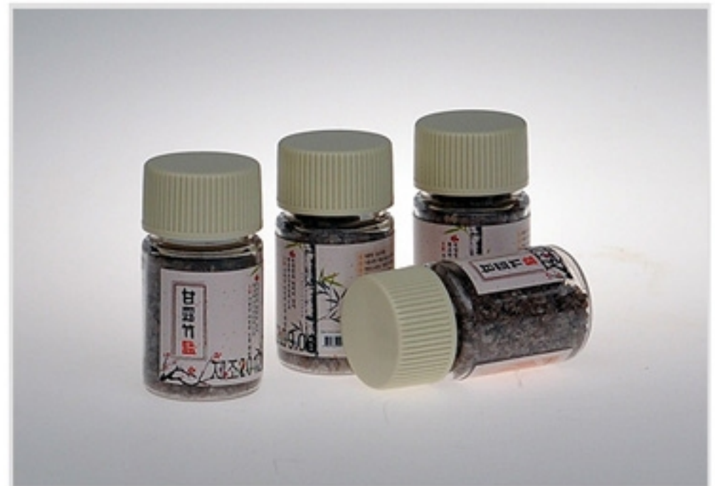
9 times Roasted Bamboo salt grain type 25g (granular Size)