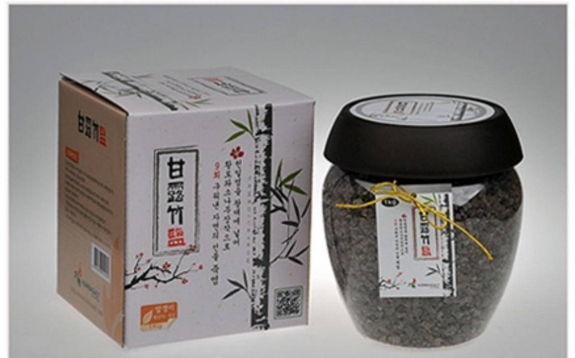
9 times Roasted Bamboo salt grain type 1kg (granular, middle, large Size)