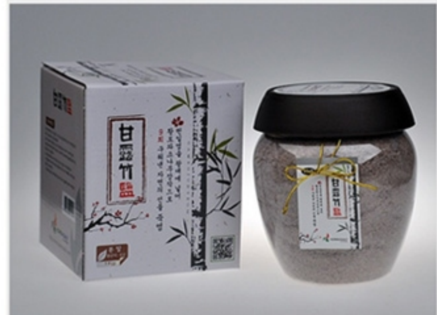
9 times Roasted Bamboo salt powder type 1kg (Rough, Fine powder)