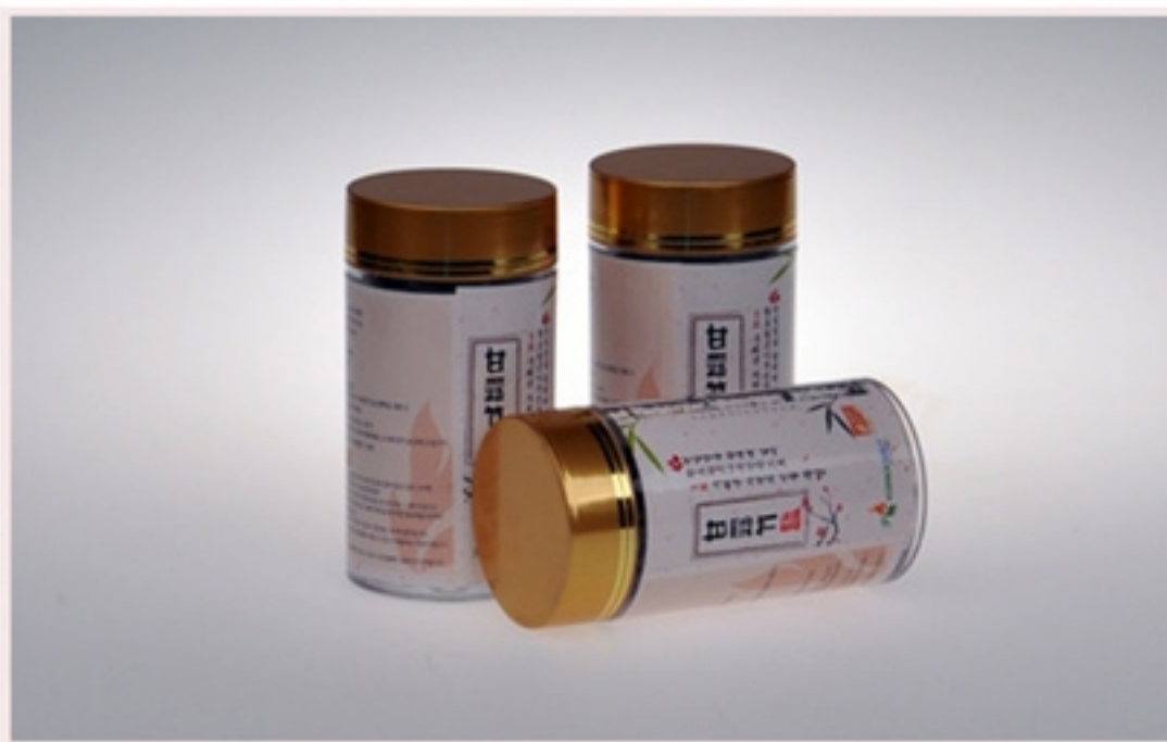
9 times Roasted Bamboo salt grain type 60g (granular Size)